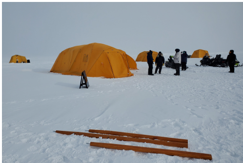
A field research camp in Utqiagvik, Alaska.