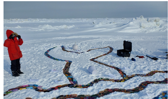
A collaboration between a Polar STEAM educator and researcher which allowed students to create small buoys and track them as the winter ice melts.