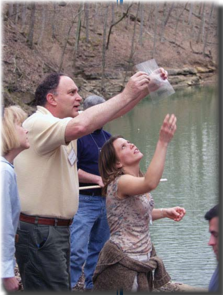
Participants in Kentucky’s first EE certification class.