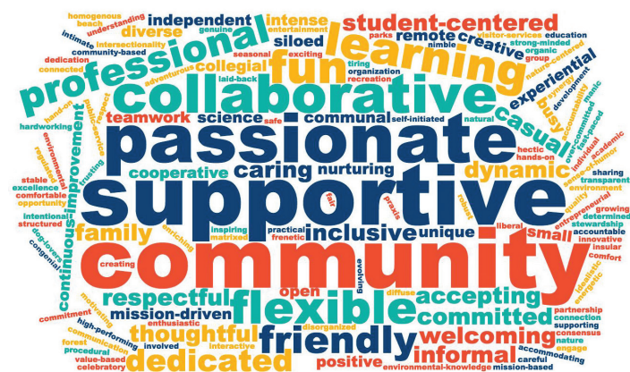
Figure 3. Organization leader work environment descriptors.

This discrepancy between how organization leaders and educators view their workplace draws attention to how the leaders collect data or feedback from their staff, particularly educators of color, about their personal experience in the workplace. Organization leaders most often reported collecting information from staff about the work environment 1 to 2 times per year, often through one-on-one meetings, employee surveys, or staff meetings. These findings, however, suggest that organizations need to think critically about establishing ongoing feedback systems to ensure that staff are empowered to share their authentic experiences. While these conversations may be difficult to have, they are imperative to support the collective growth of the organization so that it can foster a work environment that is inclusive and equitable for staff of color.