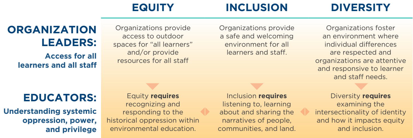
Figure 2. Organization leader and educator definitions of equity, inclusion, and diversity.

Like the educators, researchers have challenged the tendency of organization leaders to focus on access for all , which neglects the critical need to understand how systemic oppression, power, and privilege have disproportionately impacted marginalized communities, particularly people of color (Feinstein & Meshoulam, 2013; Herrenkohl & Bevan, 2017; Philip & Azevedo, 2017). This “access-for-all” narrative negates the need to prioritize these communities that have been, and continue to be, largely excluded in EE. Therefore, pushing beyond access to consider the systemic barriers that inform inequities becomes a necessity.