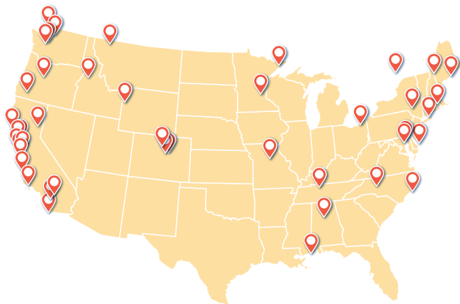
Figure 1. Map of Survey Participants

1. A survey of 51 organization leaders. These leaders (e.g., executive directors, directors of education) represented organizations from across the United States and Canada, with a heavier concentration in the western region (see Figure 1). Participants were