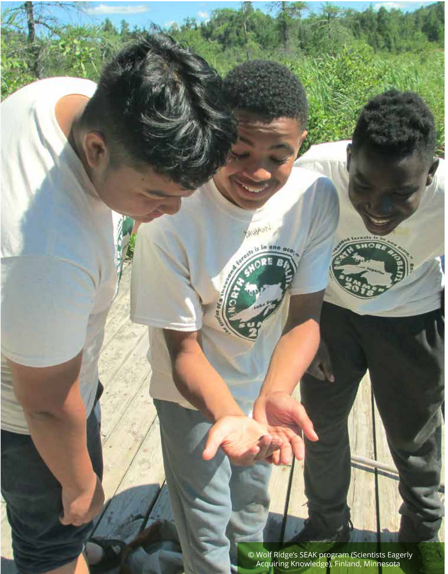
© Wolf Ridge's SEAK program (Scientists Eagerly Acquiring Knowledge), Finland, Minnesota