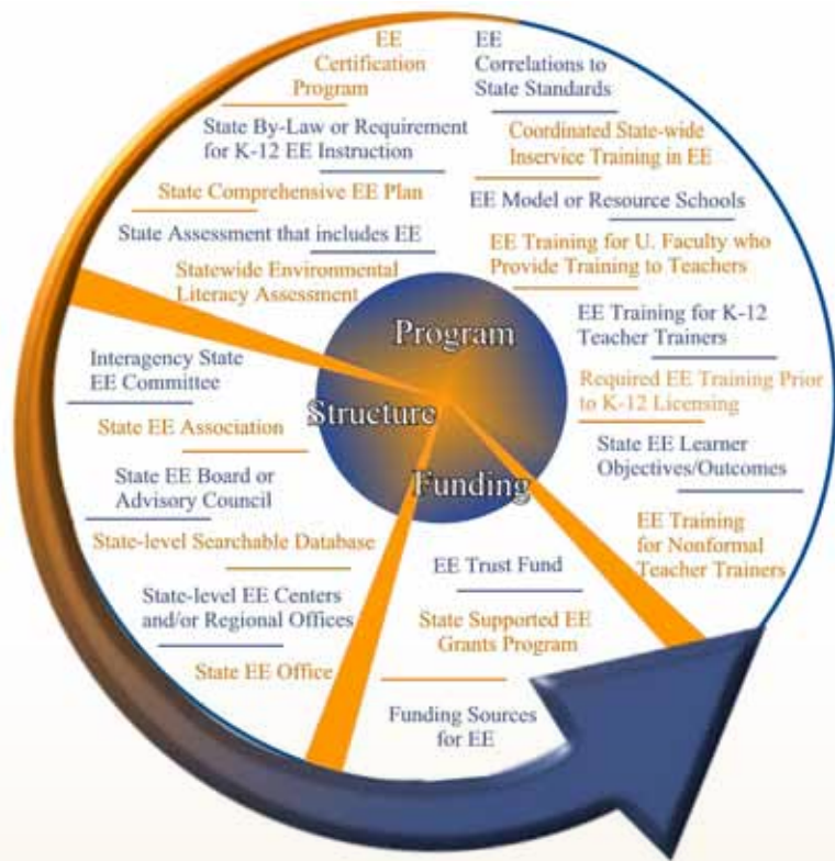
FIGURE 1: COMPONENTS OF A STATE-LEVEL COMPREHENSIVE EE PROGRAM (Right)

In some states, the early infrastructure revolved around state EE legislation that resulted in agency staff commitments to EE and the development of K-12 learning requirements. University programs