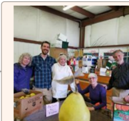
Builds relationships and community

Learn an engaging, proven and reliable process for gathering in-depth stories and impacts that help you understand your community program's true effects, fine-tune for the future, and show funders and partners how your program's effects have rippled out through the community.