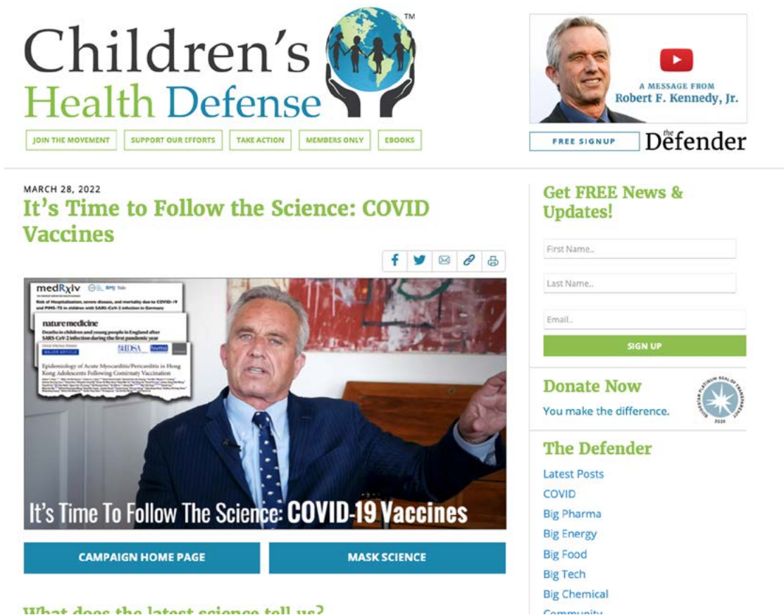
Figure 3 Front page on March 28, 2022 ( childrenshealthdefense.org/child-health-topics/health-freedom/its-time-to-follow-the-science-covid-vaccines/ )

This example can be used when teaching about vaccinations. Students may be asked to evaluate the arguments presented on the website, childrenshealthdefense.org . Again, the website is a dot-org, which might make students believe the site to be unbiased. This URL creates an opportunity for classroom discussion about internet domains and the false idea that certain domains are indicators of quality and trustworthiness.