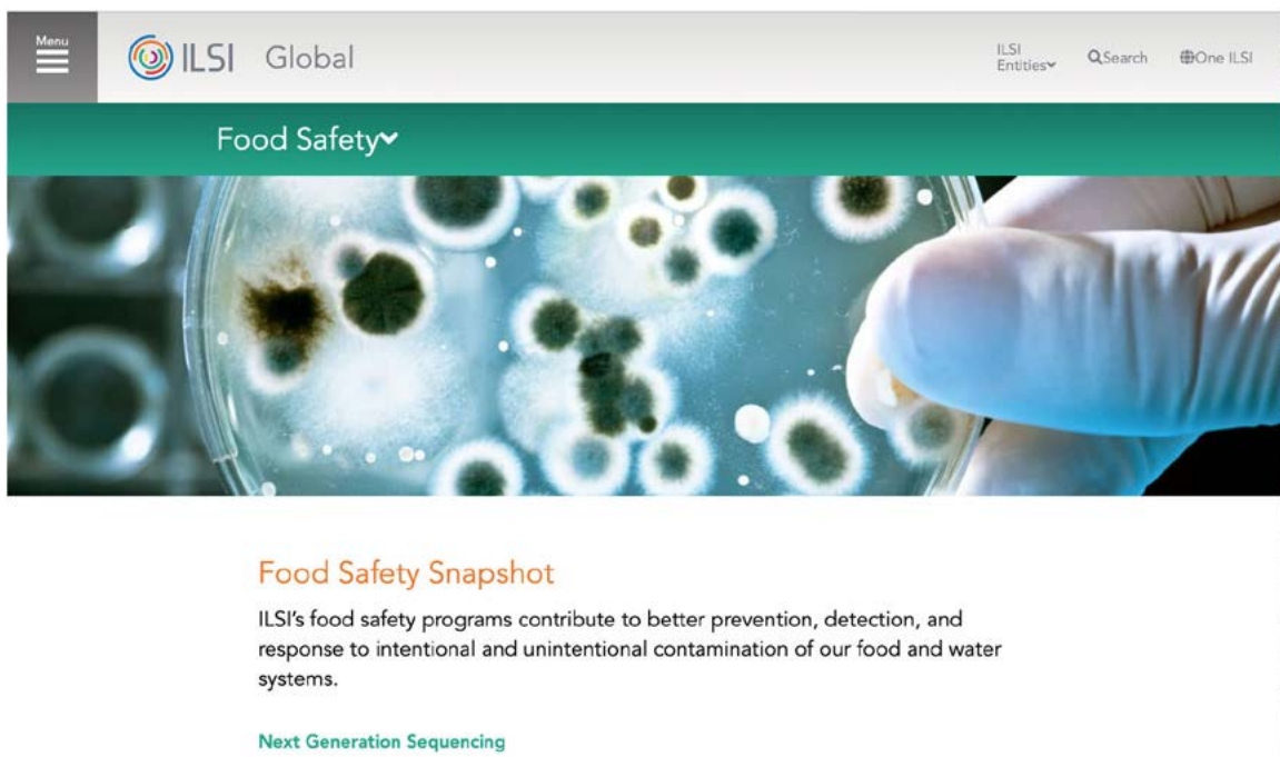
Figure 6 Food Safety page under the Science and Research tab ( ilsil.org/science-research/food-safety/ )