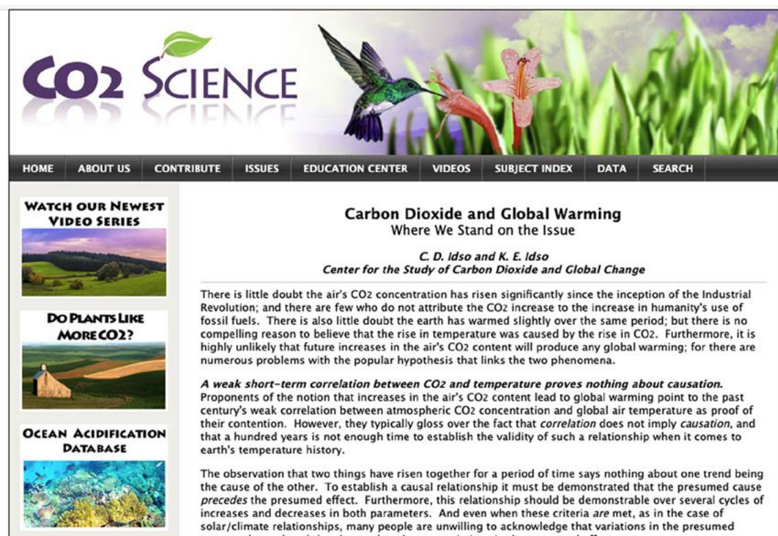
Figure 2 Article from Center for the Study of Carbon Dioxide and Global Change ( /about/position/globalwarming.php )

In the context of teaching about climate change, students might be asked to evaluate the arguments found on the website CO2science.org . On the surface it is a dot-org which might predispose the individual to think it is unbiased.